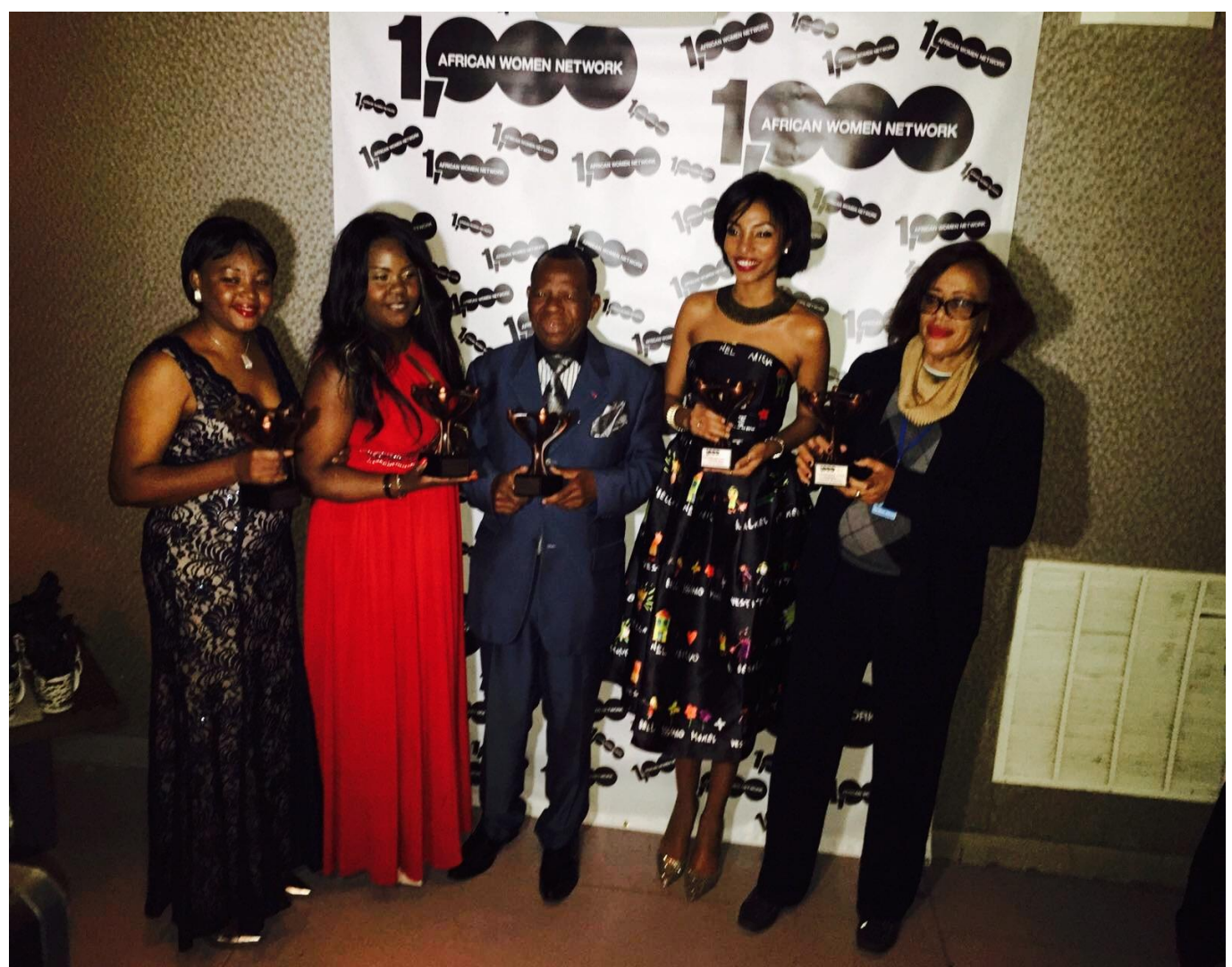
AWARD WINING RECIPIENTS AT THE GALA RECEPTION- NIGER, US,, CAMEROON, CAMEROON AND CONGO