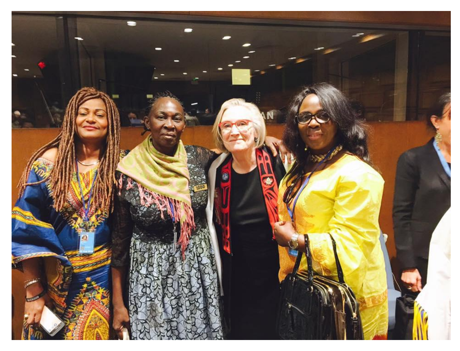
With H.E. Minister of the indigenous and northern affairs in Canada, Benett!! Made a stunning closing remarks after the panel presentation on indigenous women in the world!!!United Nations headquarters!!! With partners from Congo