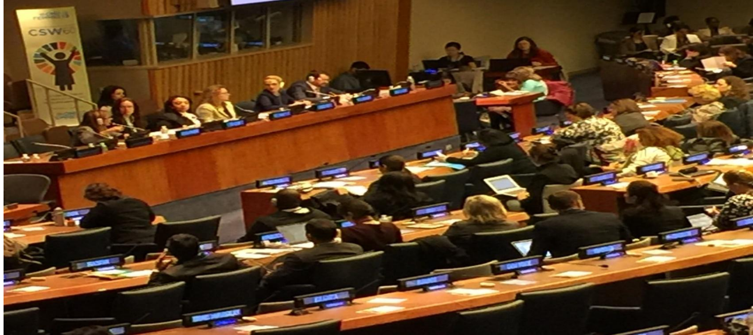
MIISS CAMEROON, VALERIE AYENA CALLED EVERY SINGLE YOUNG GIRLS ESPECIALLY IN AFRICA TO STAND