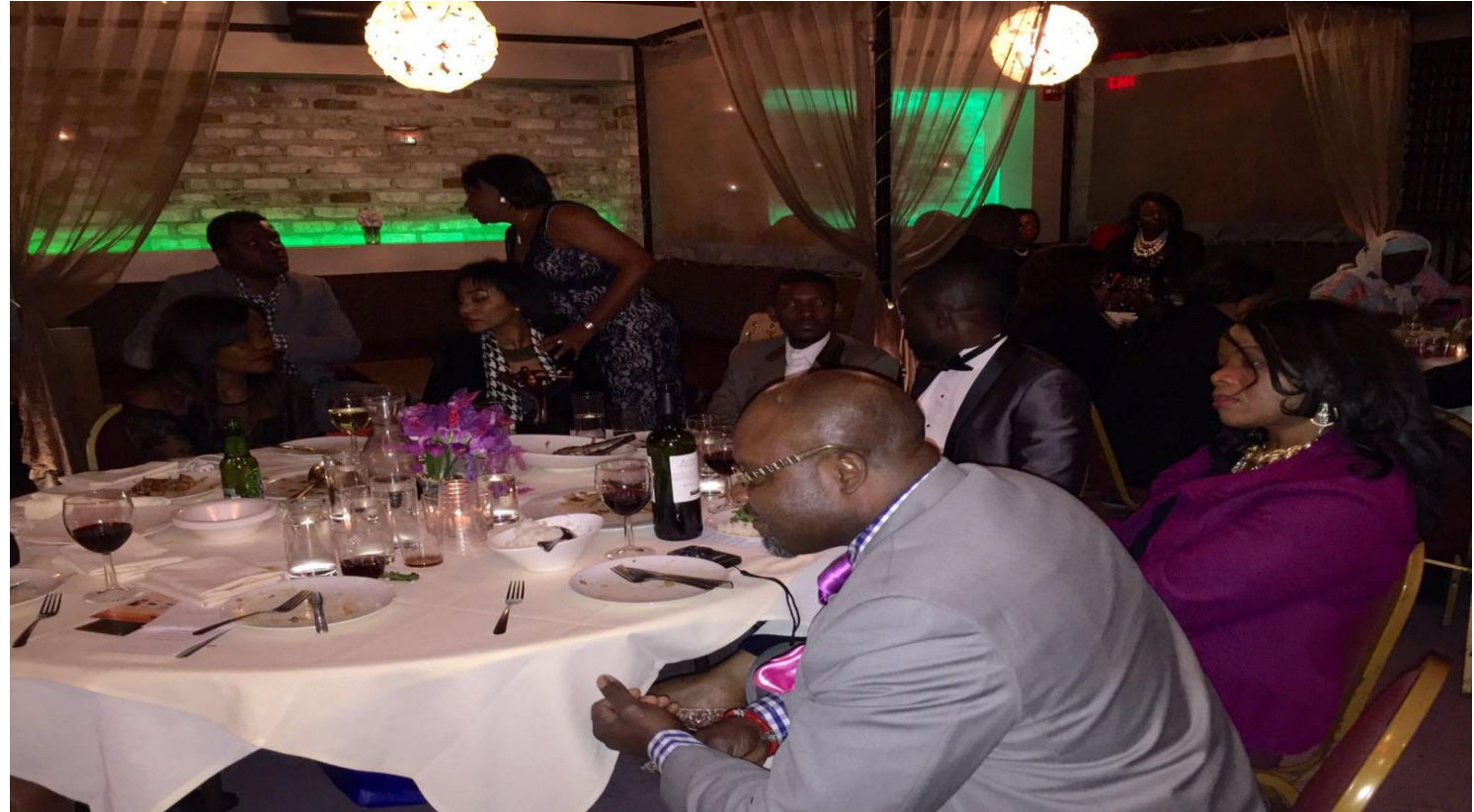
GUESTS AT THE GALA NETWORK RECEPTION