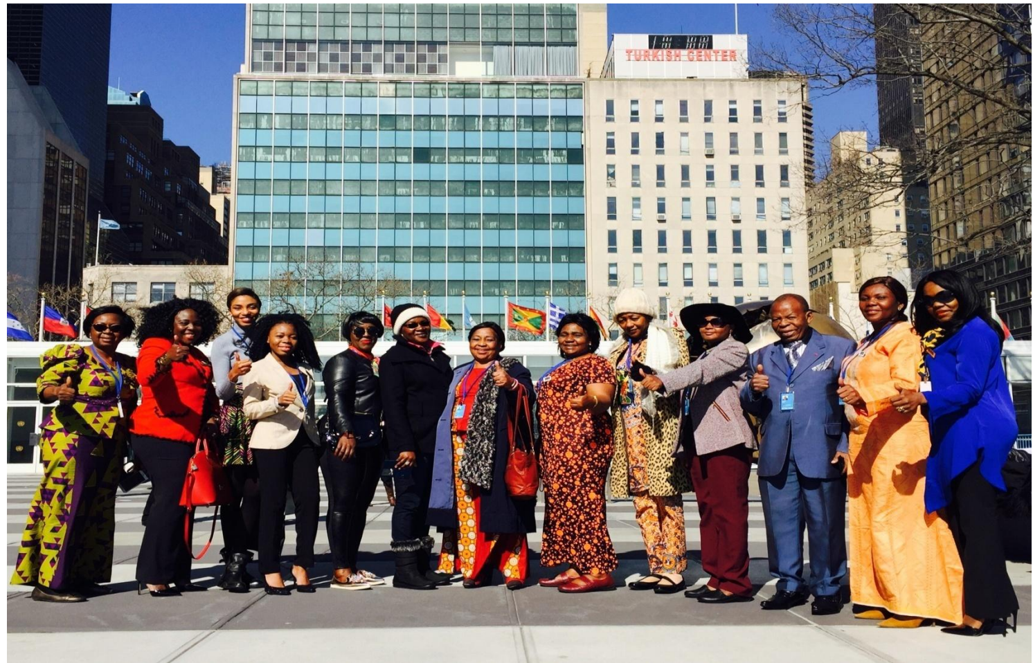
Delegates from around the world attending The CSW60 AT THE UNITED NATIONS, HEADQUATERS