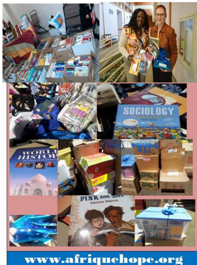
AHC Books' Drive